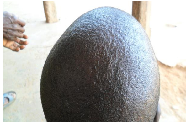
Figure (5): Black dot type Tinea capitis