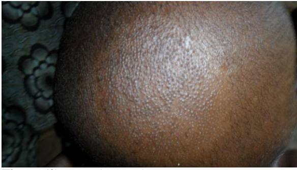
Figure (2): Annular Patch Tinea capitis