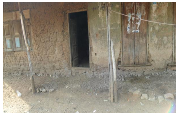
Figure (6) : Dilapidated building, uncemented floor and dermatophyte infected animals living in close contact with humans