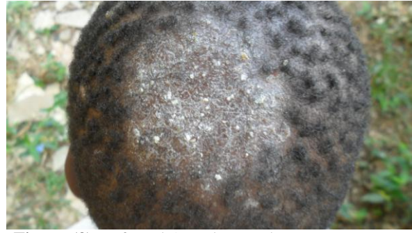
Figure (3): Infected Annular Patch Tinea capitis